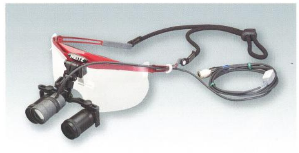
BLP-4 with NSI-III, Side Shield and Strap (NSI-III is option)