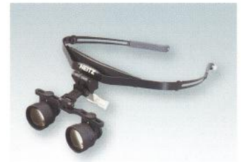
Black (with BLS-3)