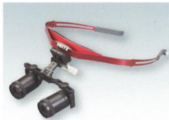
Red (with BLP-4)