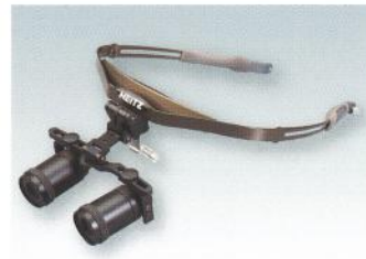
Gold (with BLP-4)