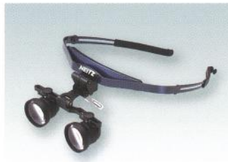
Blue (with BLS-2)